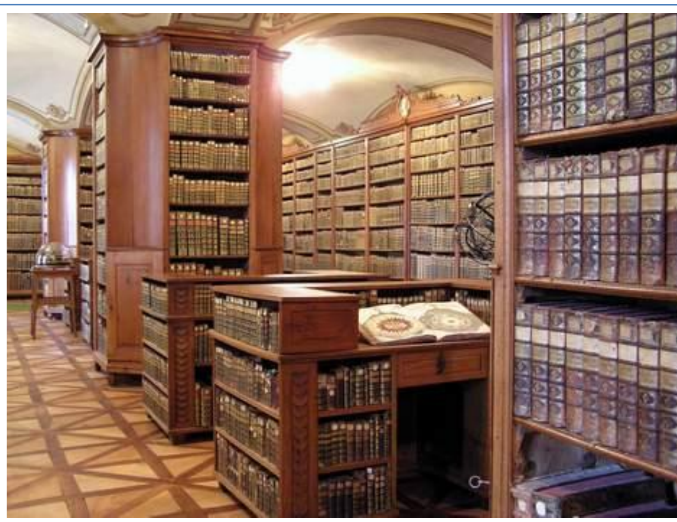
(Cathedral Library, Kalocsa, Hungary)