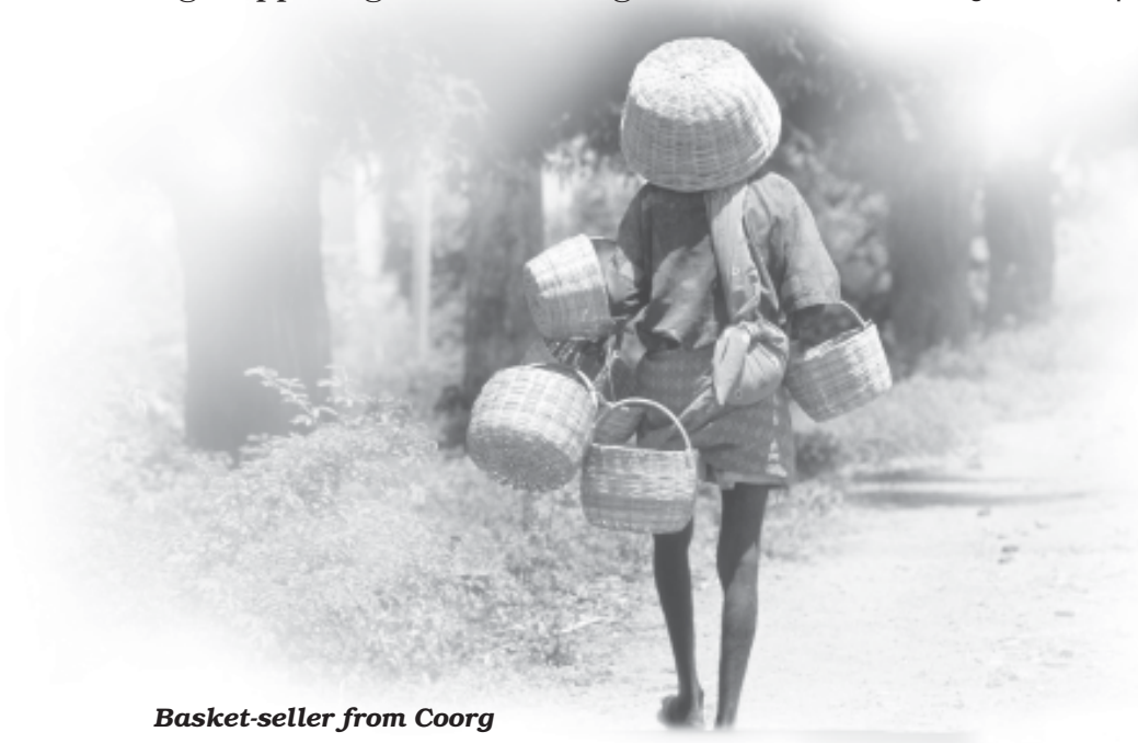
Basket-seller from Coorg

going down a cliff by sliding down a rope