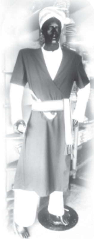
Traditional Coorgi dress