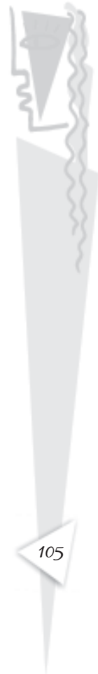
Mijbil the Otter

provoking causing anger or some other reaction